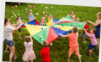
Day Camp Cost: 8:00 AM - 1:00 PM