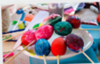
Before Camp Cost: 7:30 AM - 8:00 AM

7 weeks | Weekly Rates | Discounts | Full Day Camp | Tons of FUN!