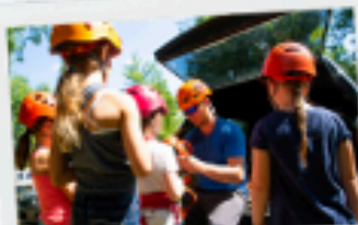
After Camp Cost: 1:00 PM - 2:00 PM